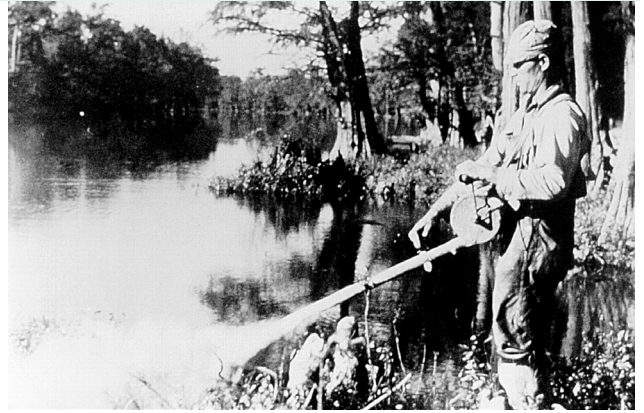
Spraying of DDT for mosquitocidal purposes

effect of DDT on the environment was made public and elimination efforts were halted 11 . Consequently, over the next several decades mosquito populations gradually re-established themselves in the U.S. and abroad. As the burden of dengue in the tropics began to increase in the 1980s and 1990s and Americans began to travel internationally more frequently, more and more travelers began to return to the U.S. with the unwanted souvenir of dengue.