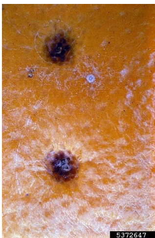
Citrus Black Spot

Not only staple crops but also fruit and nuts are being attacked by diseases spreading globally. Beside the outbreaks listed above, in the three months ending 28 February 2014 the world has seen outbreaks of other diseases in: wheat (Australia, India), rice (India, Viet Nam), potato (USA), coffee (Mexico), almonds (USA), avocados (Colombia), cashew (Tanzania), little cherry (Australia, USA), grapevines (also Australia, USA), papaya -- two different diseases (Mexico), pecan nuts (USA) and tomato (USA).