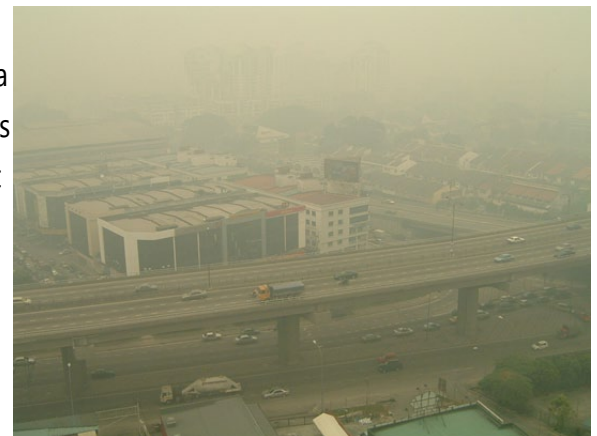
Severe haze affecting Ampang, Kuala Lumpur, Malaysia in August 2005.

Ecosystem degradation can also result in the direct release of pollutants that can exacerbate non-communicable diseases such as cardiovascular disease and chronic respiratory disease. For example, the burning of forests for slash and burn agriculture and other agricultural activities can release high levels of particulate matter and other pollutants into the air which, when inhaled, can negatively impact public health. Researchers have found that exposure to smoke (particulates) from wildfires can increase hospital admissions for respiratory diseases such as asthma and chronic obstructive pulmonary disease (COPD). These pollutants can be widely dispersed, as illustrated by periodic Indonesian forest fires set to clear land; people hundreds of kilometers away from the fires, such as in Singapore and Malaysia, experience respiratory impacts (Finlay et al. 2012).