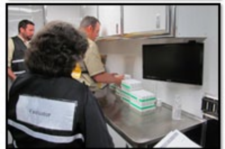
Individuals simulate dispensing human antiviral medication in the event of an outbreak