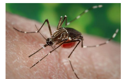
Aedes aegypti mosquito

Despite relatively low case counts in recent decades, dengue is no stranger to the United States. Dr. Benjamin Rush, a signatory of the Declaration of Independence, documented a dengue outbreak in Philadelphia in 1780. Ships arriving from foreign ports were bringing mosquitoes and infected people back to port cities in the U.S., where local outbreaks then followed. This continued along the eastern seaboard and Gulf coast for the next 150+ years: an outbreak in 1873 10 affected an estimated 40,000 residents of New Orleans, and another in 1922 10 made its way through the entire Gulf coast. The last recorded dengue outbreak in the continental U.S. occurred in 1945 when a soldier returning from Guyana to Louisiana brought the virus home with him, resulting in an outbreak in which 145 people were affected.