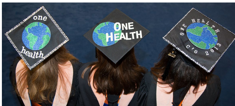
University of Florida MHS graduates' mortarboards celebrate the focus of their degrees

This past December at the University of Florida three students graduated from the first ever Master of Health Science (MHS) Environmental and Global Health (EGH) One Health concentration degree program in the United States.