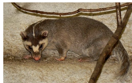
Chinese ferret-badger

Reports of anthrax in humans, sometimes without a known animal source, came from Republic of Georgia, Kenya & Zimbabwe, and in livestock without associated human infection from Argentina, Indonesia, Sweden & Togo. Rabies cases were reported from India, Indonesia and South Africa, and in animals without associated human cases in the Congo Republic, Israel, Taiwan and the USA. The Taiwan infections were first discovered last year in Chinese ferret-badgers, which are a species of the mustelid family living in the mountain forests, among which rabies may have been lurking undetected for decades.