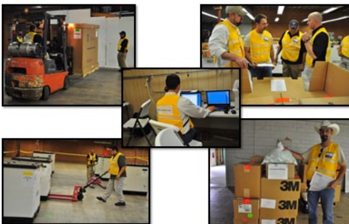
Pictured above: Participants in charge of supply distribution execute efficient dispersal of supplies during the exercise.